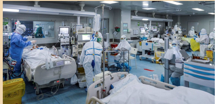
Sala de hospital durante la pandemia actual

La pregunta anterior puede surgir fácilmente en nuestras mentes cuando atravesamos tiempos difíciles, particularmente en una escala tan grande como la pandemia actual. Puede parecer que Dios esté ausente o despreocupado o incluso que Dios no exista. Otra tentación es pensar que Dios nos está castigando por algo. Pero, como he mencionado en homilías pasadas, Dios no nos castiga y Dios no causa la maldad. Por lo tanto, las enfermedades, los desastres naturales, las guerras, el hambre, etc., no son castigos de Dios. Más bien, son simplemente parte del precio que los humanos tenemos que pagar por vivir en un mundo imperfecto con seres humanos imperfectos. En Génesis se nos dice que el mundo es bello y bueno; sin embargo, sigue siendo imperfecto. Nuestros cuerpos humanos son organismos asombrosos; sin embargo, nuestros cuerpos y genes también son imperfectos. Así que los bebés a veces nacen con imperfecciones inexplicables y las personas a veces se enferman de cáncer, diabetes, Alzheimer y otras enfermedades terribles simplemente porque nuestros cuerpos imperfectos son susceptibles a ellas. Los seres humanos somos