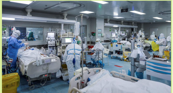
Hospital ward during current pandemic

The question above can easily pop into our minds when we are going through difficult times, particularly on such a large scale as the current pandemic. It can seem that God is absent or unconcerned or even that God does not exist. Another temptation is to think that God is punishing us for something. But, as I have mentioned in past homilies, God does not punish us, and God does not cause evil. Therefore, disease, natural disasters, wars, famine, etc. are not a punishment from God. Rather, they are simply part of the price we humans have to pay for living in an imperfect world with imperfect human beings. We are told in Genesis that the world is beautiful and good; yet it is still imperfect. Our human bodies are amazing organisms; yet our bodies and genes are also imperfect. So babies are sometimes born with inexplicable imperfections and people sometimes get sick with cancer, diabetes, Alzheimer’s and other terrible diseases simply because our imperfect bodies are susceptible to them. Human beings are good because we are made in the image of God; yet we are also prone to sin and cause damage to others and to ourselves.