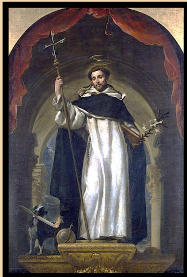
Sto. Domingo de Guzmán por Claudio Coello, circa 1685

Santo Domingo, el santo patrón de nuestra parroquia y el fundador de los Dominicos, conocidos oficialmente como la Orden de Predicadores, (por eso tenemos las iniciales “O.P.” después de nuestros nombres), nació alrededor del año 1170 en Caleruega, pequeño pueblo en el norte de España. Antes de que se concibiera, se dice que su mamá tuvo un sueño que daría a luz a un perro con una antorcha en su boca que parecía encender todo el mundo con su fuego (por esta razón en las imágenes de Sto. Domingo suele haber a sus pies un perro llevando una antorcha en su boca). Los Dominicos siempre hemos interpretado este sueño como un símbolo del fuego de la predicación de Sto. Domingo y de la Orden que habría de establecer.