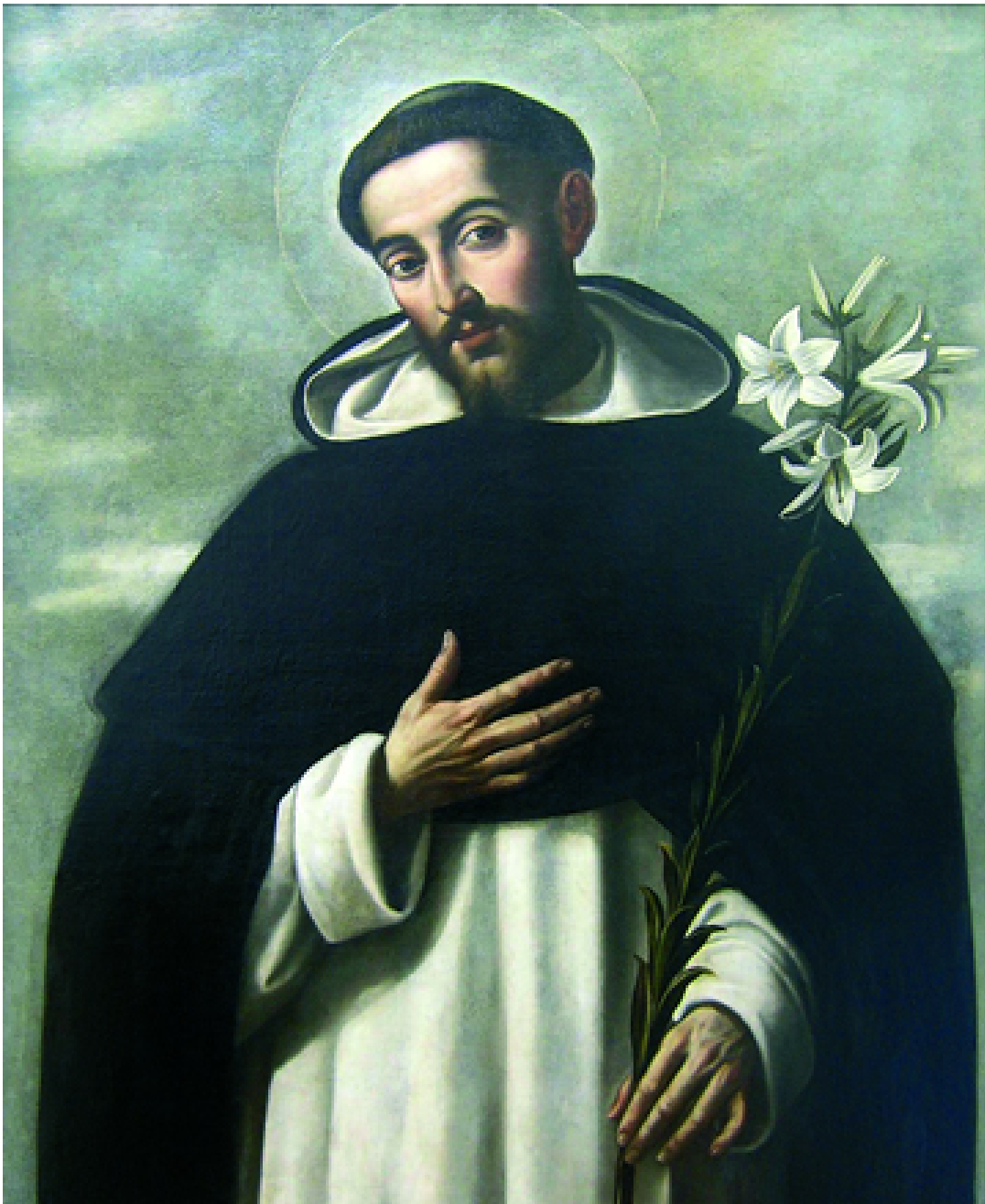
SAINT DOMINIC OF GUZMAN Founder of the Order of Preachers

2002 Merton Ave., Los Angeles CA 90041 Email: info@saintdominics.org (323) 254-2519 Website: saintdominics.org