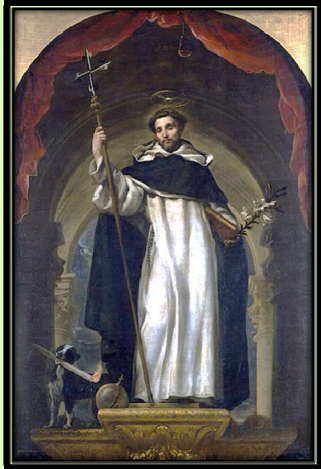
St. Dominic by Claudio Coello, circa 1685

St. Dominic, the patron saint of our parish and the founder of the Dominican Order, known officially as the Order of Preachers, (that’s why we have the initials “O.P.” after our names), was born around 1170 in Caleruega, a small village in northern Spain. Before he was conceived, it is said that his mother had a dream she would give birth to a dog with a torch in its mouth that seemed to set the whole world on fire (this is why images of St. Dominic often have a dog with a torch in its mouth at his feet). Dominicans have always interpreted the dream to be a symbol of the fire of Dominic’s preaching and that of the Order he was to establish.