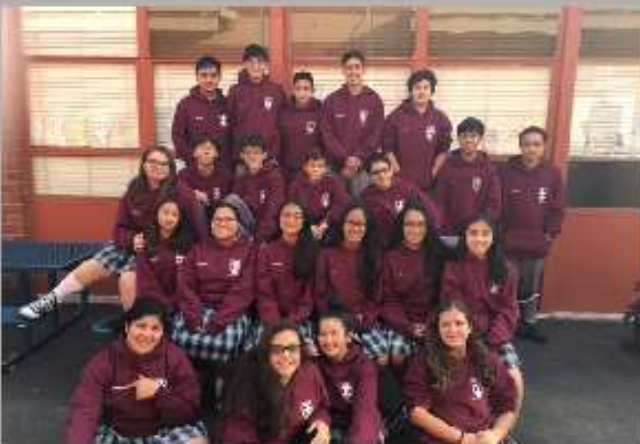
Eighth grade in their Class of 2017 sweatshirts!