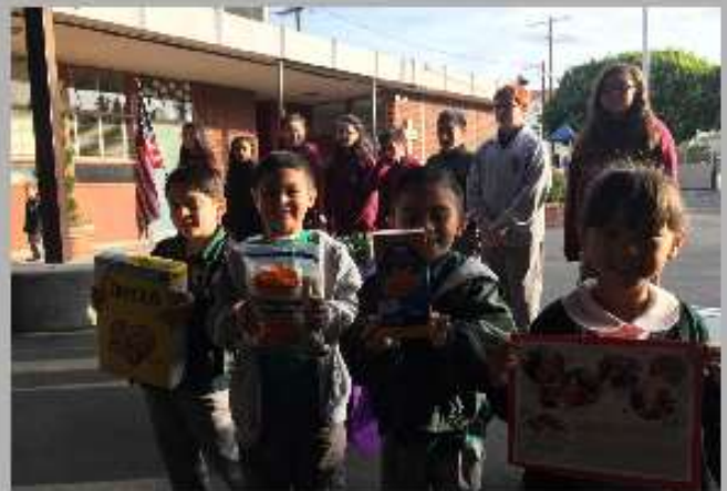
September Service Project: First Grade collecting food for Our Lady of the Angel's Adopt-a-Family program