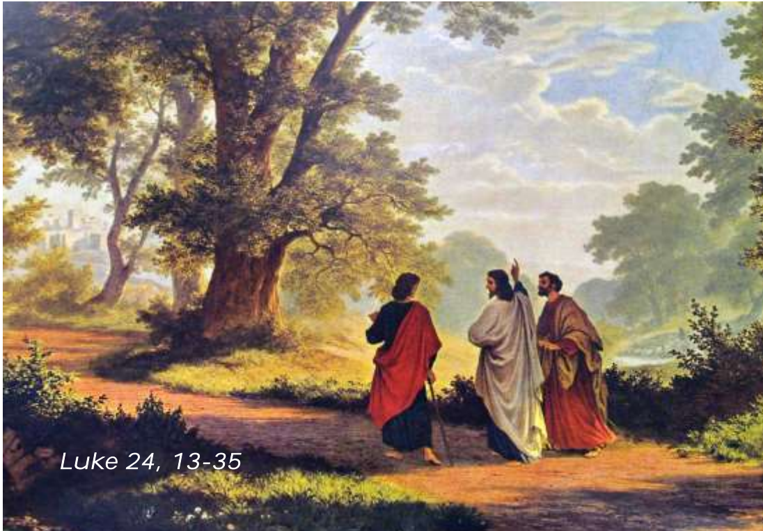
Luke 24, 13-35