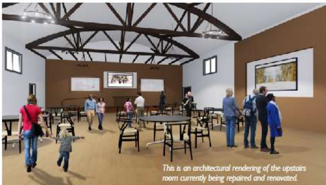
This is an architectural rendering of the upstairs room currently being repaired and renovated.