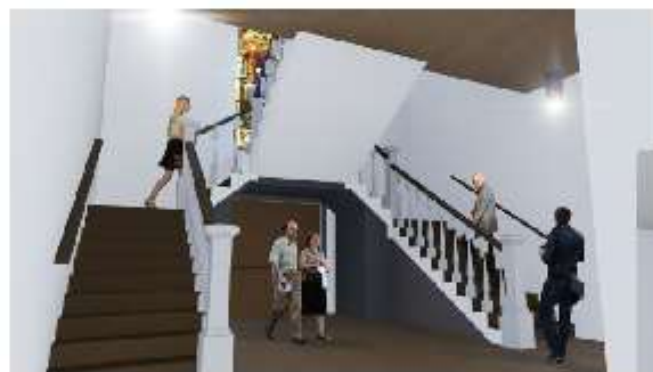
A rendering of the new meeting space taken from part of the dining area on the first floor. This work will be done after our campaign is completed.

Another feature to be completed after the campaign includes the installation of an already purchased stained glass window of St. Dominic receiving the Rosary from Our Lady as part of the grand staircase.