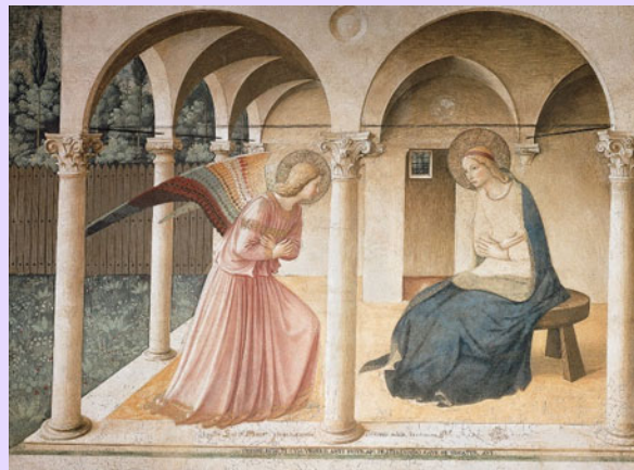
The Annunciation, by The Dominican artist, Fra Angelico, 1395-1455.

On this 4 th Sunday of Advent we remember the past three weeks and hopefully we have prepared our hearts for the coming of our Lord Jesus on Christmas Day. This has been a time of reflection that hopefully helped us to realize that we should follow the obedience to Jesus as Mary did when she said, "Behold, I am the handmaid of the Lord. May it be done to me according to your word." May God's will be our own will for how I live my life and submit to the love of Jesus.