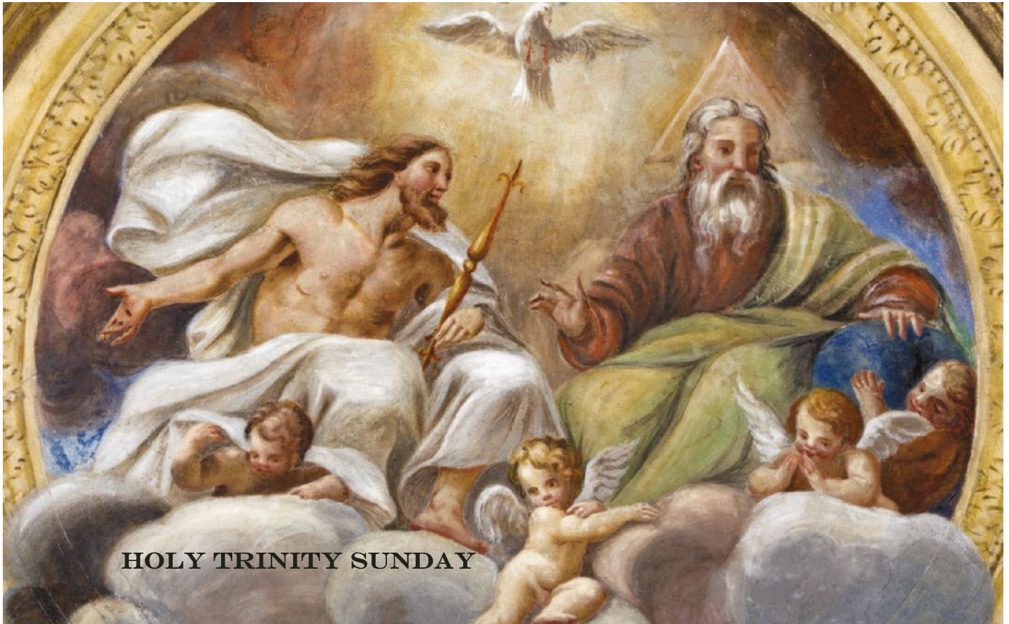
HOLY TRINITY SUNDAY

2002 Merton Ave., Los Angeles CA 90041 Email: info@saintdominics.org (323) 254-2519 Website: saintdominics.org