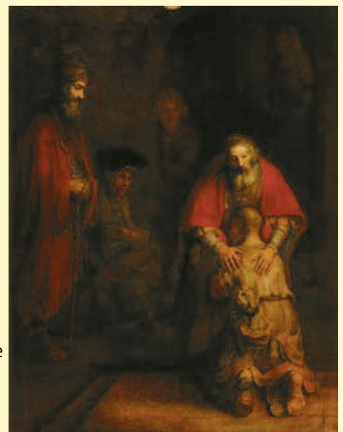
Rembrandt, El retorno del hijo pródigo , 1661-1669.

Vosotros también, pues, tenéis un llamado de Dios, para ser Su instrumento dentro de Su Iglesia para la santificación del mundo. Si no has estado muy involucrado, te insto a que te desafíes a ti mismo, ya sea a través de un ministerio que ya existe dentro de nuestra parroquia o en una iniciativa creativa para satisfacer una necesidad aquí o en la comunidad en general. Todos nosotros, por indignos que seamos, hemos sido llamados a ser discípulos y se nos ha dado una misión. No tengáis miedo.