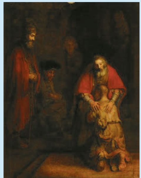
Rembrandt, The Return of the Prodigal Son , 1661–1669.

You too, then, have a calling from God, to be His instrument within His Church for the sanctification of the world. If you have not been very involved, I urge you to challenge yourself, whether it's through a ministry that already exists within our parish or in a creative initiative to meet a need here or in the wider community. All of us, unworthy though we are, have been called to be disciples and have been given a mission. Do not be afraid.