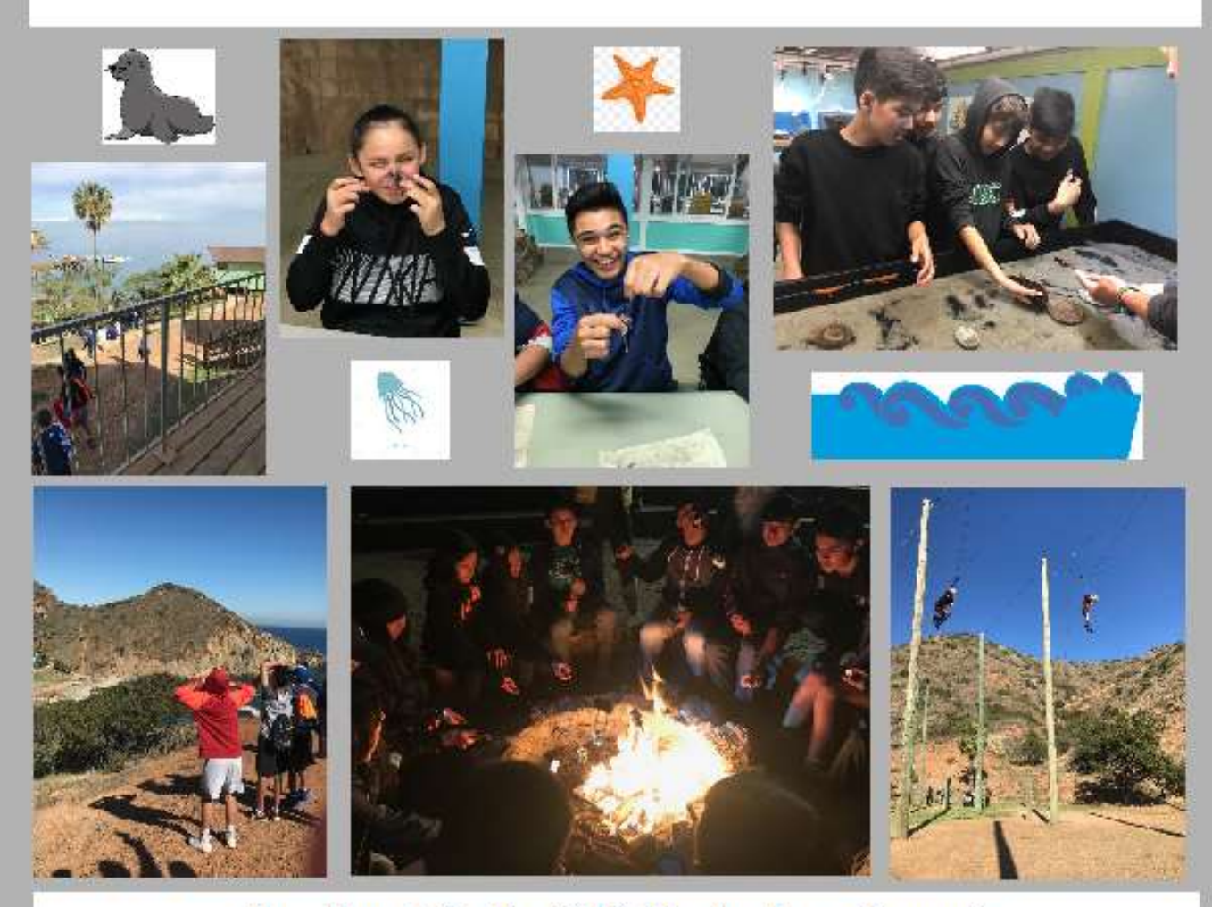
Enrollment for the 2018-19 school year is open!

Last week, the eighth grade spent three activity-packed days at the Catalina Island Marine Institute! Their adventure was filled with activities like snorkeling, dissecting squid, navigating a high ropes course, sitting around a campfire, learning about island and marine ecosystems, and more!