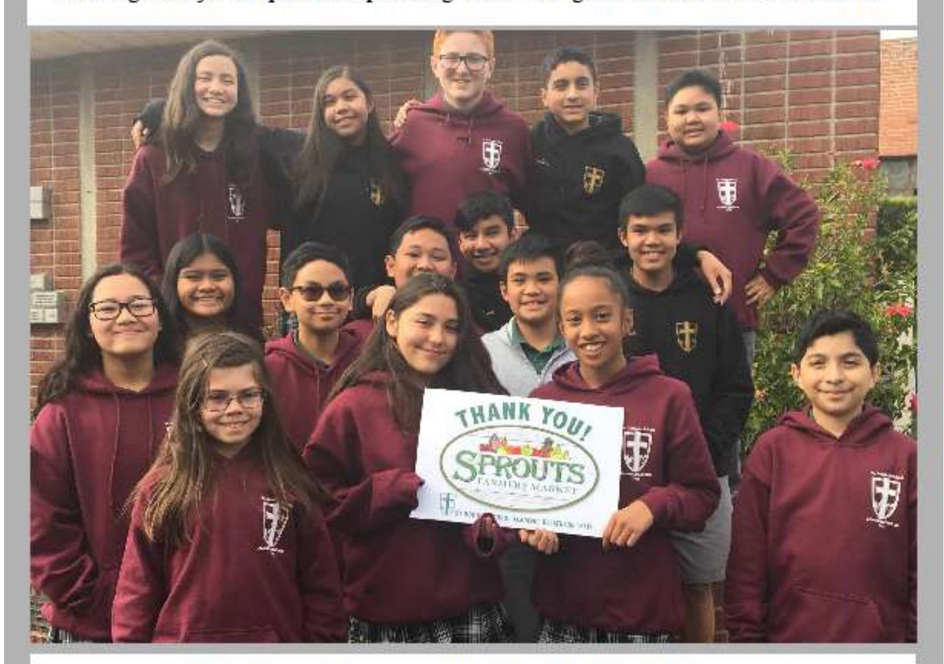
Enrollment for the 2018-19 school year is open!

And a big thank you to Sprouts for sponsoring us and making sure our decathletes were well fed!