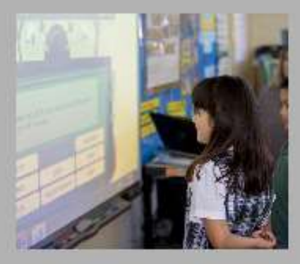
Enrollment for the 2018-19 school year is open!

Interested in St. Dominic School?? We'd love to give you a tour! Call 323-255-5803 to make an appointment. Go Saints!