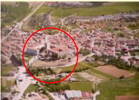
Aerial view of present-day Caleruega – the Dominican church, monastery of nuns and convent of friars is the large complex in the red circle at the center of the photo.