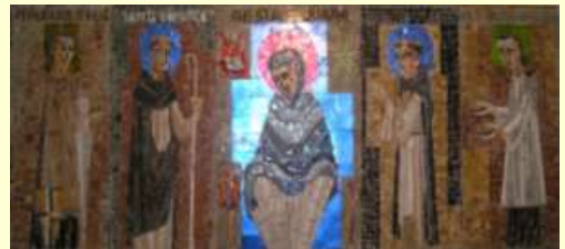
Mural of St. Dominic’s family in the crypt beneath the church in Caleruega

was most likely from a noble family as well, the family of Aza, (about 20 miles from Caleruega). She was considered “virtuous, chaste, prudent, full of compassion for those who were unfortunate and in distress, and was outstanding among all the women in the neighborhood for the excellence of her reputation.” It seems that Jane was married twice, but it is impossible to determine whether Felix was her first or second husband. Because of the holiness of her life, she was beatified in 1828 by Pope Leo XII.