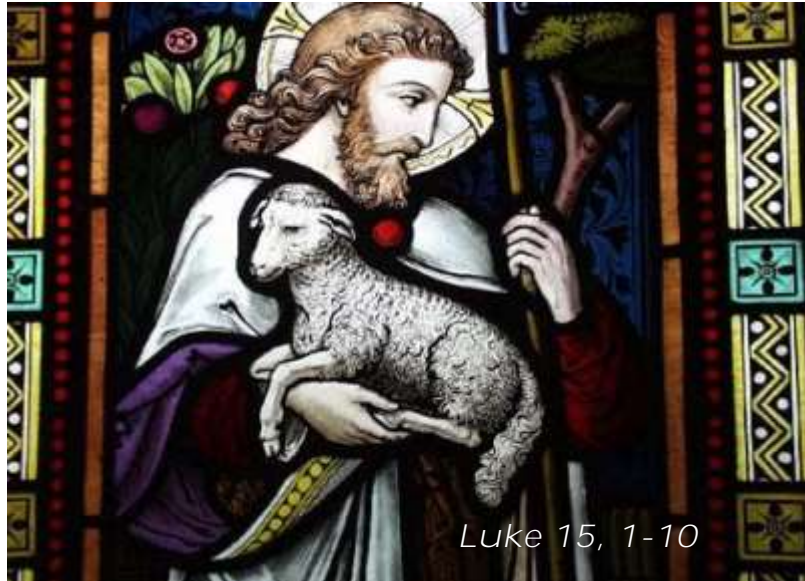
Luke 15, 1-10